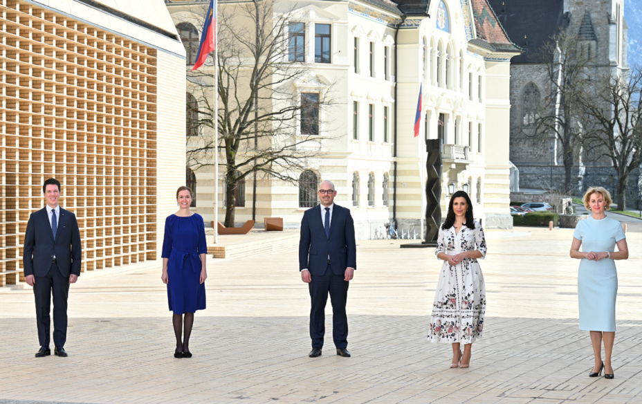
The government of the Principality of Liechtenstein emerged from this year's elections (from left): Manuel Frick, Sabine Monauni, Daniel Risch, Dominique Hasler, Graziella Marok-Wachter