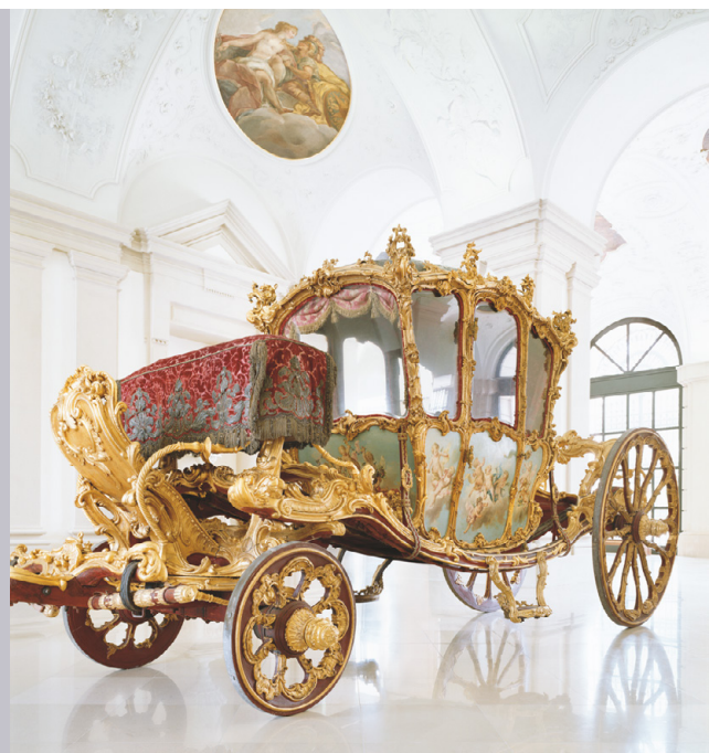
The members of the Czech-Liechtenstein Society will have the opportunity see the Golden Chariot in the Liechtenstein Garden Palace during their visit to the exhibition on 15 October.

Pre-Christmas party of the members of the Association in Prague