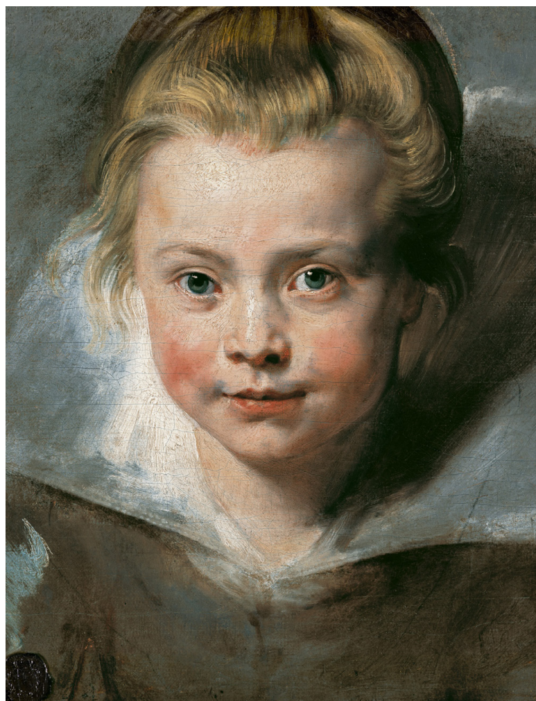
Peter Paul Rubens, 1616, Portrait of Clara Serena Rubens

The magnificent Decius Mus Cycle by Peter Paul Rubens, which ranks among the greatest masterpieces of the Princely Collection, will take the central place