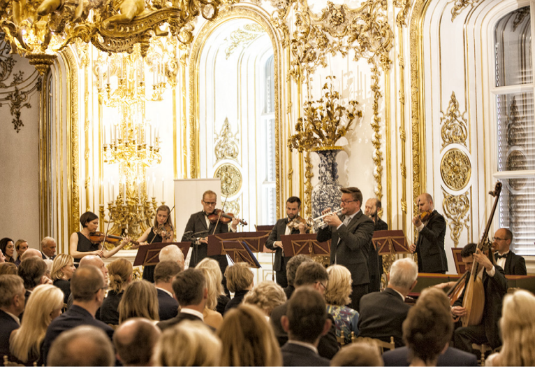
Remembrance of the first LVHF concert in Vienna, which took place in the Liechtenstein City Palace in 2019